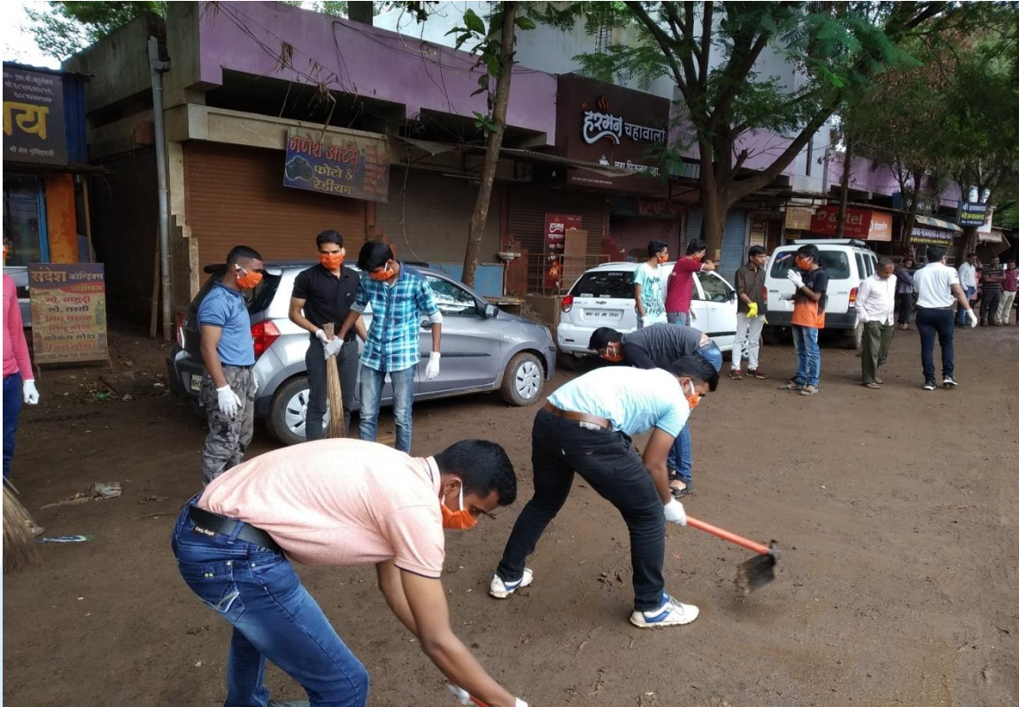
Cleaning started from main street