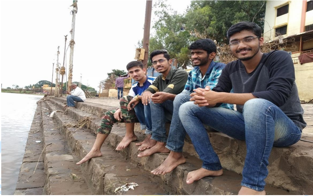
A small rest after work...